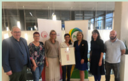
Presentation of the special stamp "100 years Luxembourg Midwives Association"

Discover Luxembourg's latest stamp collecting news at