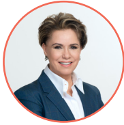
President HRH The Grand Duchess of Luxembourg