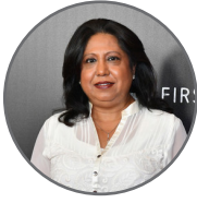
Pramila Patten Special Representative of the Secretary General on sexual violence in conflict United Nations