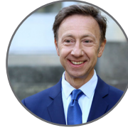
Secretary General Stéphane Bern Journalist & TV/Radio host