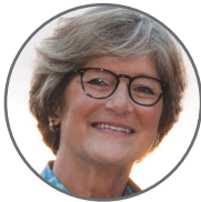
Martine Brousse President of La Voix de l'Enfant and National Commissioner for the Rights of the Child