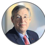
François Heisbourg General Councillor for Europe International Institute for Strategic Studies