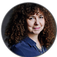
Valérie Toranian Editor-in-chief, writer, La Revue des Deux Mondes