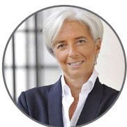
Christine Lagarde President of the European Central Bank AWAITING CONFIRMATION