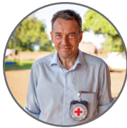
Peter Maurer Historian and President of the International Committee of the Red Cross