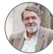
Charles Margue Sociologist and member of Chambre des Députés (Déi Gréng)