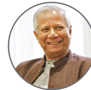
Muhammad Yunus Founder Grameen Bank