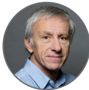
Jean-Christophe Rufin Member of the Académie Française, doctor, writer, diplomat.