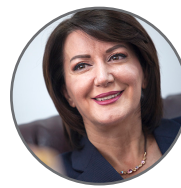
Atifete Jahjaga Former President of Kosovo