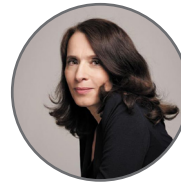
Véronique Olmi Writer, scenarist, co-fonder of Festival "Paris des Femmes"