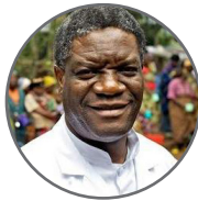
Dr Denis Mukwege Gynecologist and women's rights militant