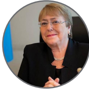
Michelle Bachelet High Commissioner for Human Rights