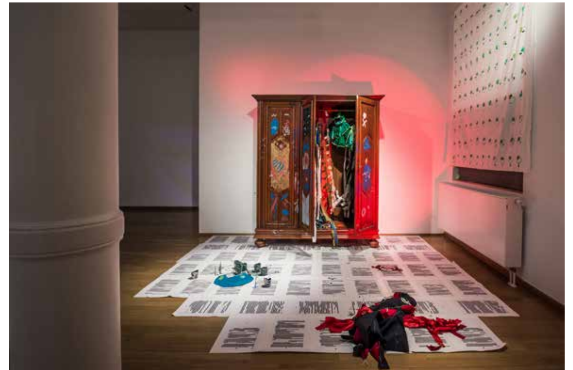
Installation view

that she gradually transformed into a place for discoveries, encounters and exchanges with the visitors.