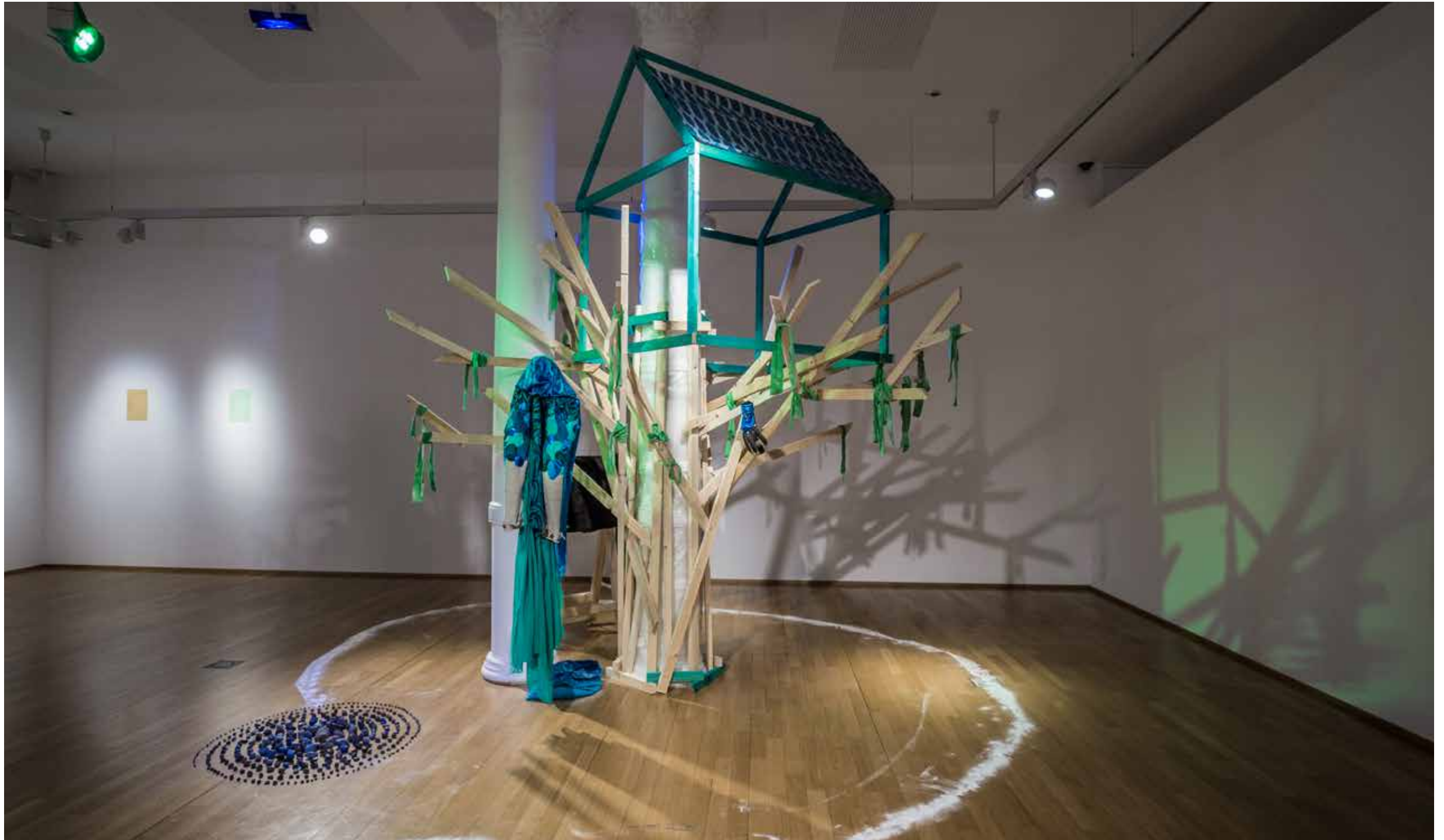
Installation view